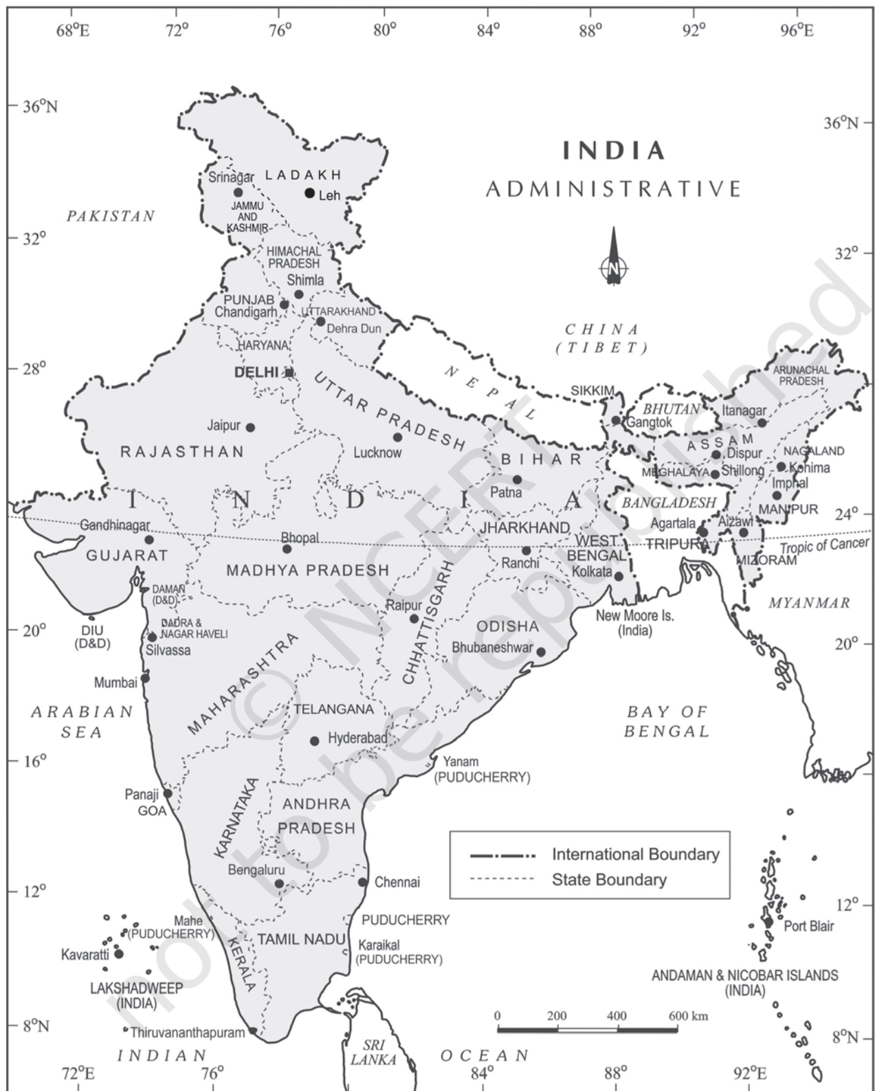
Figure 1.1 : India : Administrative Divisions