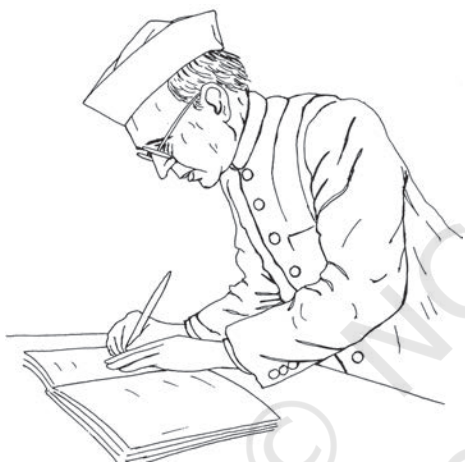
Jawaharlal Nehru CAD, Vol. VI, p. 734

We have already seen that President is the formal head of the government. In this formal sense, the President has wide ranging executive, legislative, judicial and emergency powers. In a parliamentary system, these powers are in reality used by the President only on the advice of the Council of Ministers. The Prime Minister and the Council of Ministers have support of the majority in the Lok Sabha and they are the real executive. In most of the cases, the President has to follow the advice of the Council of Ministers.