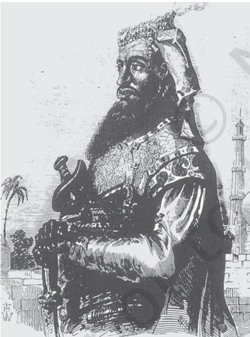
Fig. 11.4 Nana Sahib At the end of 1858, when the rebellion collapsed, Nana Sahib escaped to Nepal. The story of his escape added to the legend of Nana Sahib's courage and valour.