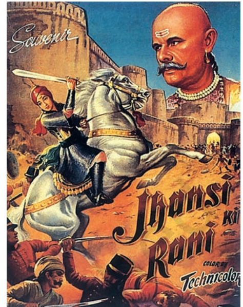
Fig. 11.18 Films and posters have helped create the image of Rani Lakshmi Bai as a masculine warrior

These images did not only reflect the emotions and feelings of the times in which they were produced. They also shaped sensibilities. Fed by the images that circulated in Britain, the public sanctioned the most brutal forms of repression of the rebels. On the other hand, nationalist imageries of the revolt helped shape the nationalist imagination.