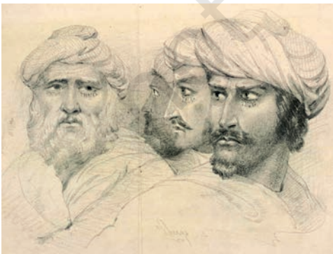
Fig. 11.19 Faces of rebels