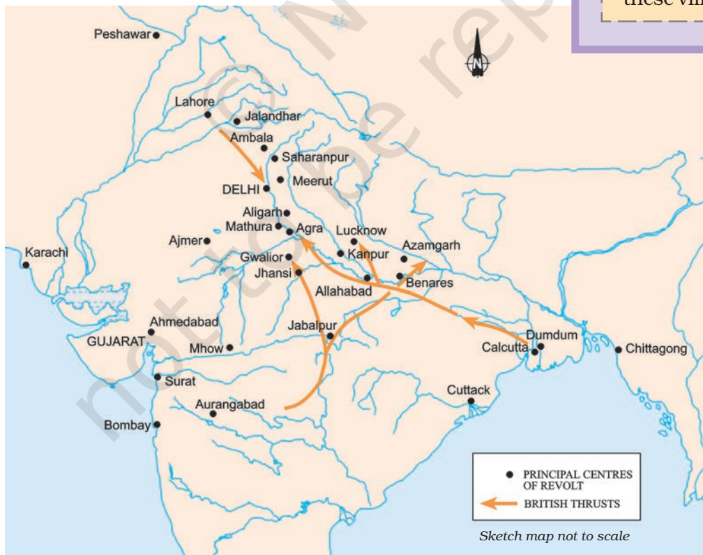
Map 2 The map shows the important centres of revolt and the lines of British attack against the rebels.

➤ What, according to this account, were the problems faced by the British in dealing with these villagers?