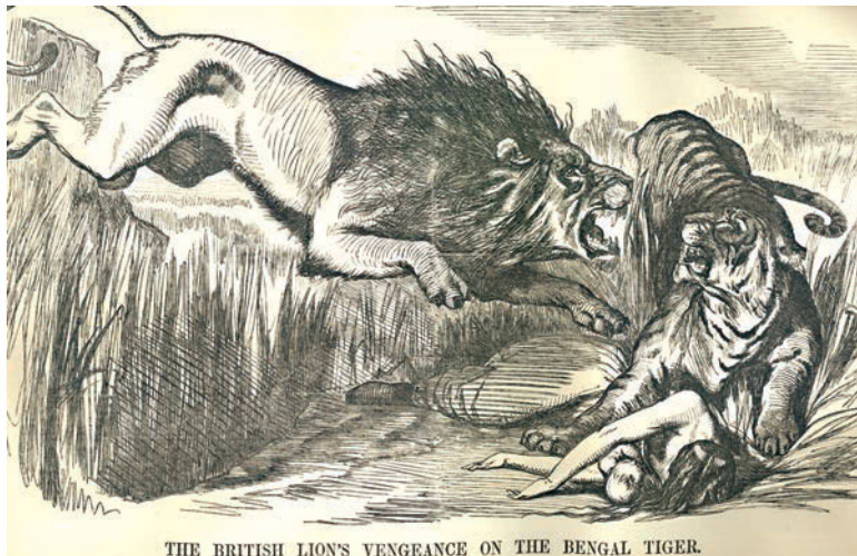
Fig. 11.14 The caption at the bottom reads “The British Lion’s Vengeance on the Bengal Tiger”, Punch , 1857.

➤ What idea is the picture projecting? What is being expressed through the images of the lion and the tiger? What do the figures of the woman and the child depict?