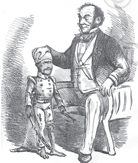
THE CLEMENCY OF CANNING.

In one of the cartoons published in the pages of Punch , a British journal of comic satire, Canning is shown as a looming father figure, with his protective hand over the head of a sepoy who still holds an unsheathed sword in one hand and a dagger in the other, both dripping with blood (Fig.11.17) – an imagery that recurs in a number of British pictures of the time.