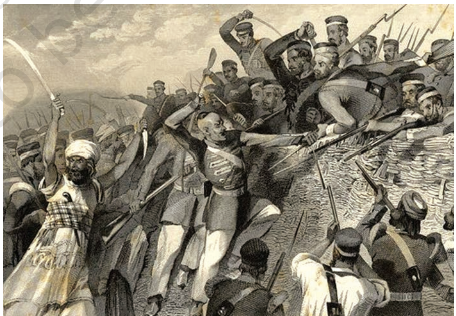
Fig. 11.2 Ordinary people join the sepoys in attacking the British in Lucknow.

Firangi , a term of Persian origin, possibly derived from Frank (from which France gets its name), is used in Urdu and Hindi, often in a derogatory sense, to designate foreigners.