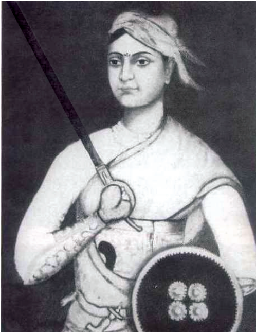
Fig. 11.3 Rani Lakshmi Bai, a popular image