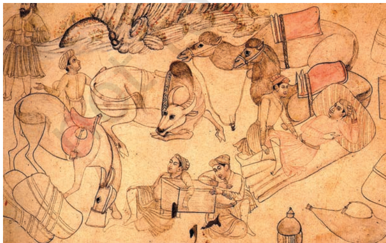
Fig. 5.14 A painting depicting travellers at rest