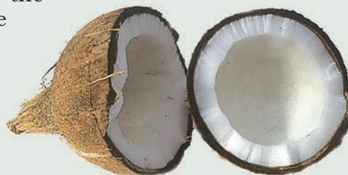
Fig. 5.1b A coconut The coconut and the paan were things that struck many travellers as unusual.