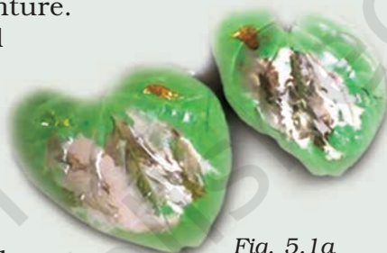
Fig. 5.1a Paan leaves

In this chapter we shall see how our knowledge of the past can be enriched through a consideration of descriptions of social life provided by travellers who visited the subcontinent, focusing on the accounts of three men: Al-Biruni who came from Uzbekistan (eleventh century), Ibn Battuta who came from Morocco, in northwestern Africa (fourteenth century) and the Frenchman François Bernier (seventeenth century).