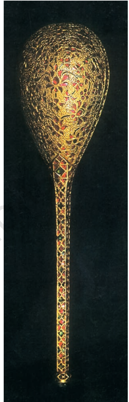
Fig. 5.12 A gold spoon studded with emeralds and rubies, an example of the dexterity of Mughal artisans

➔ In what ways is the description in this excerpt different from that in Source 11?