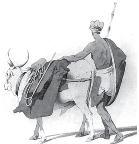
Fig. 5.11 Drawings such as this nineteenth-century example often reinforced the notion of an unchanging rural society.

As an extension of this, Bernier described Indian society as consisting of undifferentiated masses of impoverished people, subjugated by a small minority of a very rich and powerful ruling class. Between the poorest of the poor and the richest of the rich, there was no social group or class worth the name. Bernier confidently asserted: "There is no middle state in India."