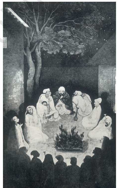
Fig. 5.5 An eighteenth-century painting depicting travellers gathered around a campfire

Compare the objectives of Al-Biruni and Ibn Battuta in writing their accounts.