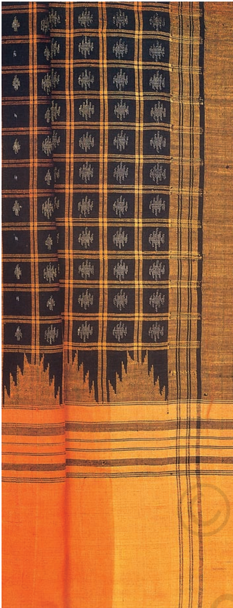
Fig. 5.10 Ikat weaving patterns such as this were adopted and modified at several coastal production centres in the subcontinent and in Southeast Asia.

➡ Why do you think Ibn Battuta highlighted these activities in his description?