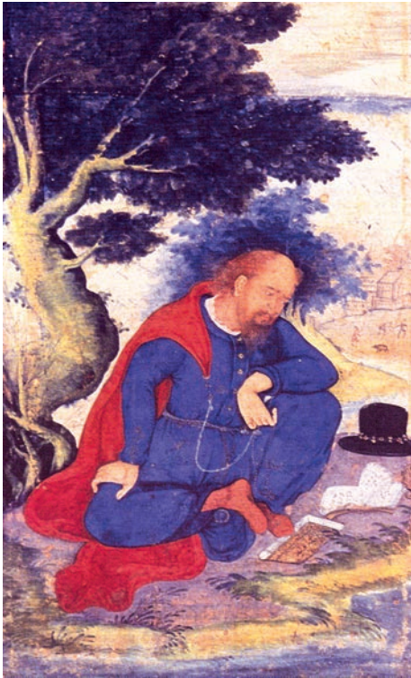
Fig. 5.6 A seventeenth-century painting depicting Bernier in European clothes