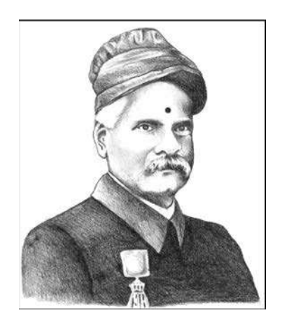
Raja Ravi Varma

You can see the many diverse levels that cultural change, resulting from our colonial encounter with the west, took place. In the contemporary context often conflicts between generations are seen as cultural conflicts resulting from westernisation. Have you seen this or faced this? Is Westernisation the only reason for generational conflicts? Are conflicts necessarily bad?