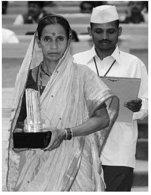
A woman Panch with her reward