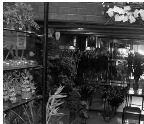
Farming of flowers