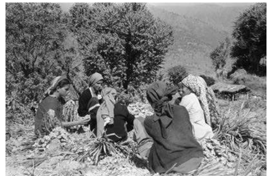
Cultivation in different parts of the country