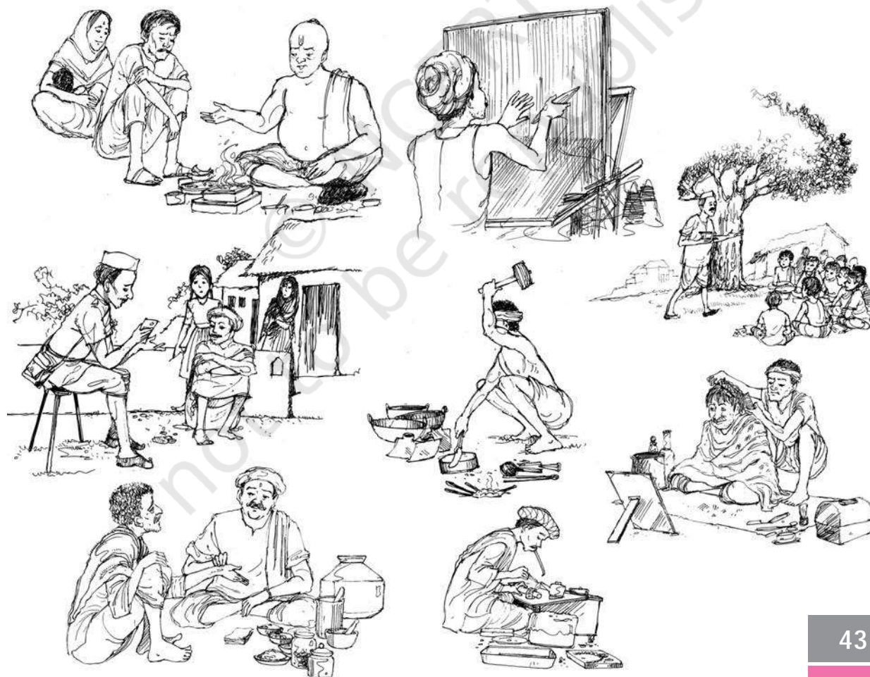
The Diversity of Occupations