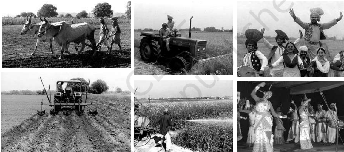
Different means of agriculture and related festivals.

Indian society is primarily a rural society though urbanisation is growing. The majority of India's people live in rural areas (69 per cent, according to the 2011 Census). They make their living from agriculture or related occupations. This means that agricultural land is the most important productive resource for a great many Indians. Land is also the most important form of property. But land is not just a 'means of production' nor just a 'form of property'. Nor is agriculture just a form of livelihood. It is also a way of life. Many of our cultural practices and patterns can be traced to our agrarian backgrounds. You will recall from the earlier chapters how closely interrelated structural and cultural changes are. For example, most of the New Year festivals in different regions of India – such as Pongal in Tamil Nadu, Bihu in Assam, Baisakhi in Punjab and Ugadi in Karnataka to name just a few – actually celebrate the main harvest season and herald the beginning of a new agricultural season. Find out about other harvest festivals.