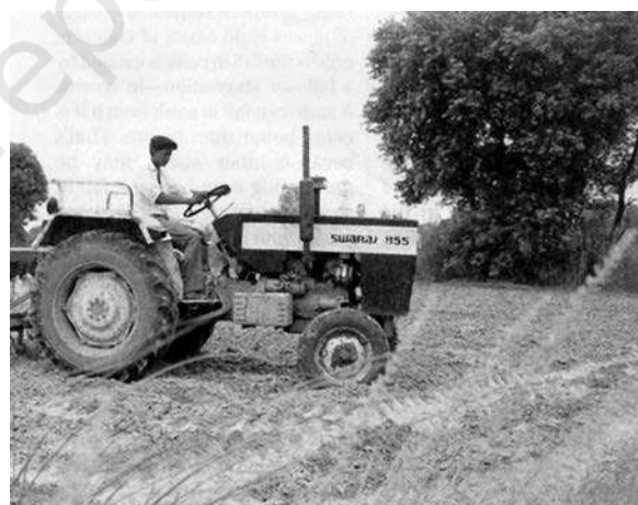
Changing technologies in agriculture