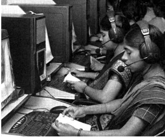
A Call Centre

A new international division of labour has emerged in which more and more routine manufacturing production and employment is done in the Third World cities. You have already dealt with outsourcing in Chapter 4 and contract farming in Chapter 5. Here we simply draw upon the example of Nike company to illustrate how this works.