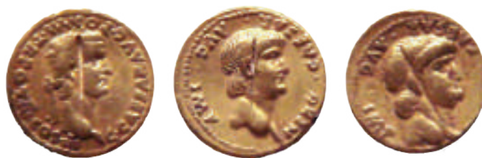
Fig. 11.12. Roman gold coins excavated in Pudukottai India

The use of coinage helped boost India's maritime trade with the world. For example, they were found in parts of Kerala and Tamil Nadu. This throws light on the trading activities of southern India with the rest of the world. Based on this finding, scholars conclude that the trade was in favour of India.