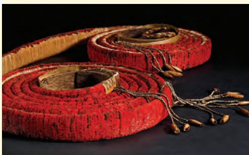
Fig. 11.2.3. Tevau (Red feather coil made from birds' feathers) used as money on the Solomon Islands.