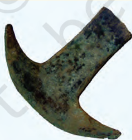
Fig.11.2.2. The Aztec copper Tajadero (Spanish word for chopping knife) was a form of money used in Central Mexico and parts of Central America.