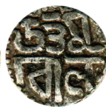
Silver coin showing tiger emblem of Cholas (850–1279 CE)