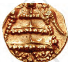
Coinage from Chalukyas of Kalyana featuring Varaha (avatar of Viṣṇu) and Royal Parasol