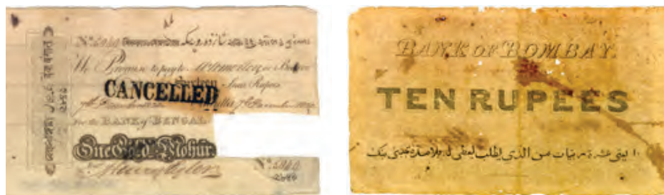
Fig. 11.15. Uniface notes of Bank of Bengal (Left) and Ten rupee note from Bank of Bombay

with the use of paper money. Paper money or currency was first used in China and was introduced in India in the late 18th century.