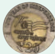
Coin with symbol marking India's 75 years of independence in 2021