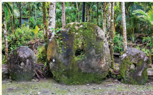
Fig. 11.2.1. Stone Money: Giant discs of rock – called Rai stones – were used as money on the Yap Island, in the Pacific Ocean country of Micronesia.

The barter system was the earliest form of exchange. There is a lot of evidence of it from around the world. People used commodities such as cowrie shells, salt, tea, tobacco, cloth, cattle (cows, goats, horses, sheep), seeds, etc.