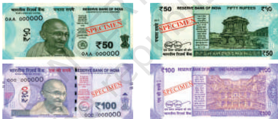
Fig. 11.16. Paper currency today