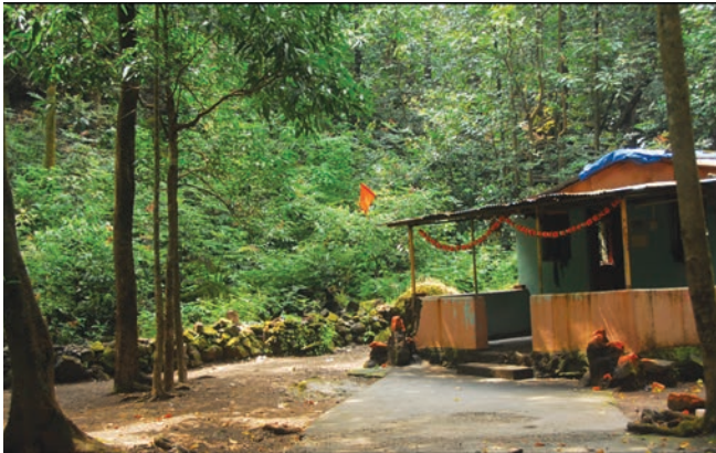
Fig. 8.13. Kalkai temple, Mulshi, Maharashtra