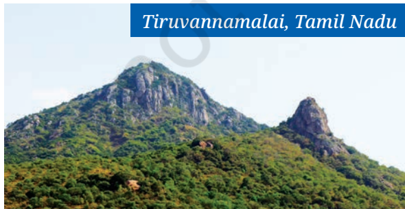
Tiruvannamalai, Tamil Nadu