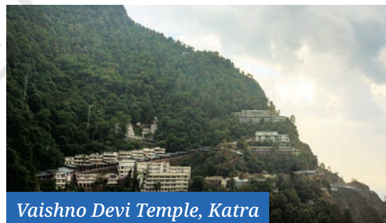
Vaishno Devi Temple, Katra