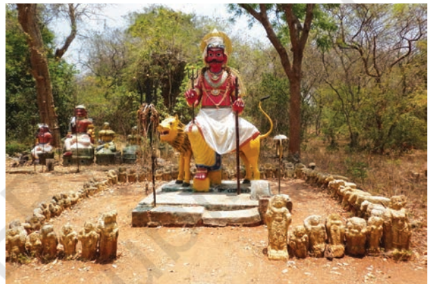
Fig. 8.16. Udaiyankudukadu Karumbayiramkondan, Tamil Nadu

Given below are the names of a few sacred groves in a few regional languages of India. Can you add to this?