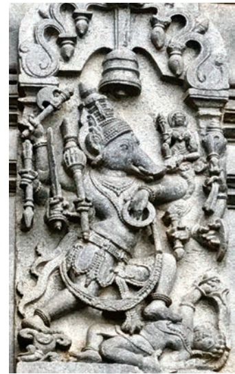
Fig. 8.5. In this image, Viṣṇu in the form of his boar avatar crushes a demon and saves Bhūdevī (Mother Earth), shown here sitting on his elbow (from the Belur temple, Karnataka)

This tradition comes from the perception of a divine presence in all of Nature. Ultimately, the whole of planet Earth is considered sacred — she is Mother Earth or Bhūdevī.