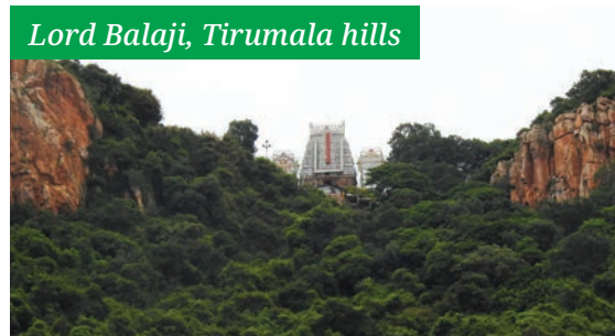
Lord Balaji, Tirumala hills