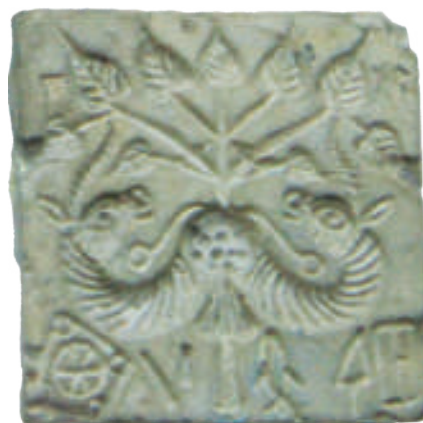
Fig. 8.12. A seal from Mohenjo-daro

Observe this seal from Mohenjo-daro. Can you recognise the leaves at the top? As you can see, the peepul tree has been an important part of India's cultural geography for millennia.