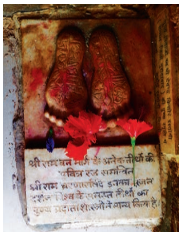
Fig. 8.11. A shrine in Bastar, Chhattisgarh, celebrating Rāma's passing through the area