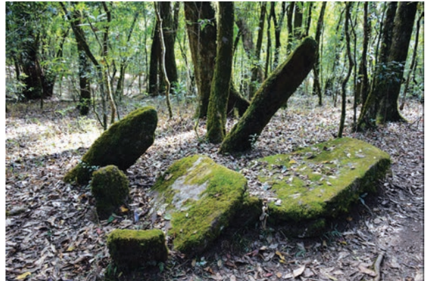
Fig. 8.14. Mawphlong, Shillong