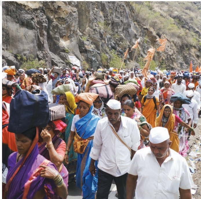
Fig. 8.4. Pandharpur wārī, an 800-year-old tradition in Maharashtra. Wārī means a pilgrimage that is held regularly, in this case annually. Pilgrims walk in large groups for 21 days to the famous Vithoba temple in Pandharpur.

Tirthankara: Literally, someone who makes a tīrtha , that is, who guides the crossing from ordinary to higher life. In Jainism, the Tirthankaras are the supreme preachers of dharma.