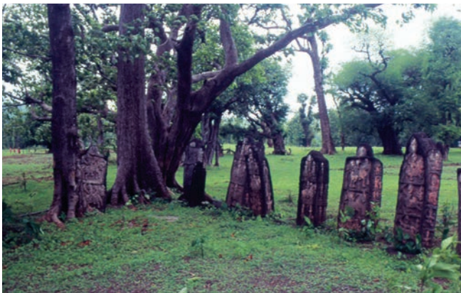
Fig. 8.15. From the sacred groves of the Bhils