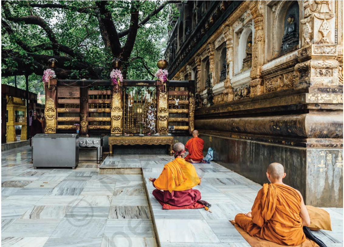
Fig. 8.10. The tree in the Mahabodhi Temple at Bodh Gaya is often cited as a direct descendant of the original tree under which, according to Buddhist tradition, the Buddha attained enlightenment — hence the names ‘bodhi tree’ and ‘Bodh Gaya’.

In many parts of India, trees are adorned with offerings like turmeric and kumkum . One species of fig tree commonly called ‘peepul’ (or ‘pipal’), ‘bo tree’ or ‘bodhi tree’ ( aśvattha in Sanskrit) is sacred to Hinduism, Buddhism, Sikhism and Jainism. In fact, its botanical name is Ficus religiosa (literally, in Latin, the ‘religious’ or sacred fig tree).