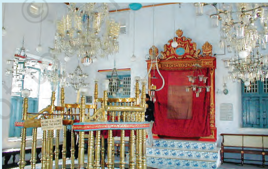
Fig. 5.3. The interior of the synagogue at Kochi.