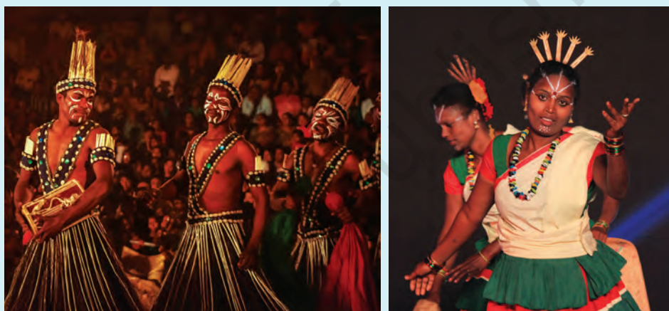
Fig. 5.11. Siddi dancers

What clues do you get about African and Indian cultural integration from the pictures here and above? Identify and name a few features that are distinctly Indian.