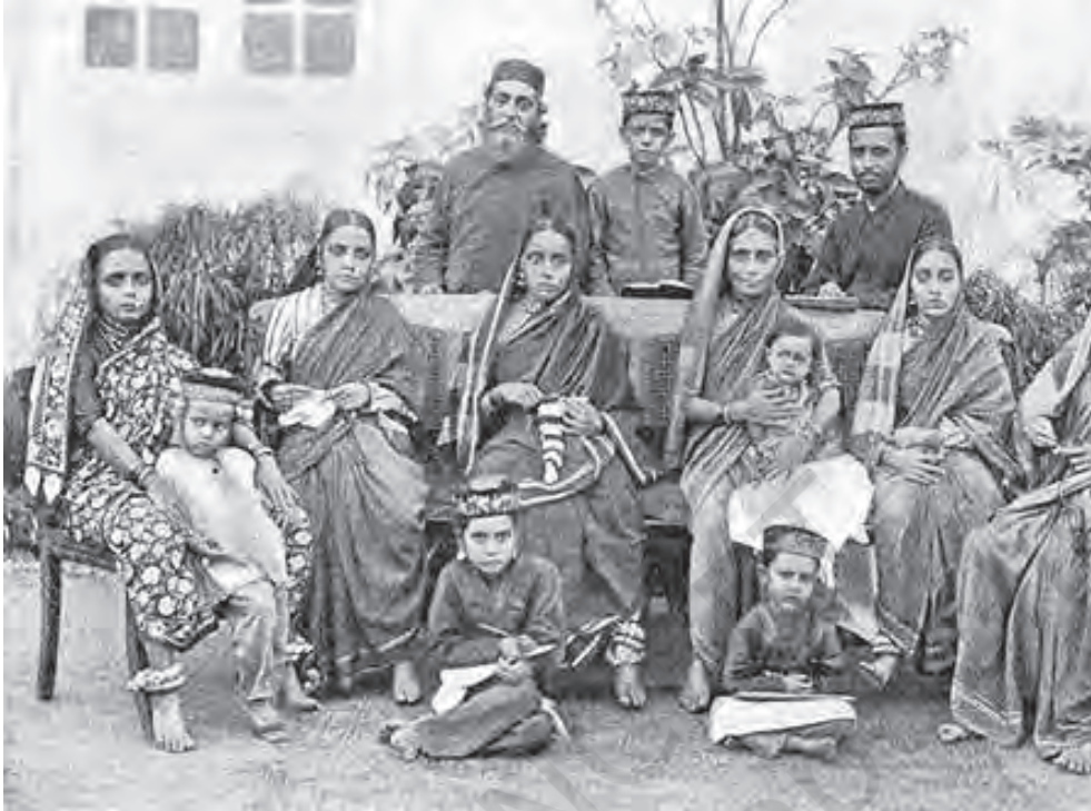
Fig. 5.4. A Jewish family in Mumbai, late 19th century.

Observe the picture Fig. 5.4. What clues do you get about the integration of the Jewish community into Indian society over time?