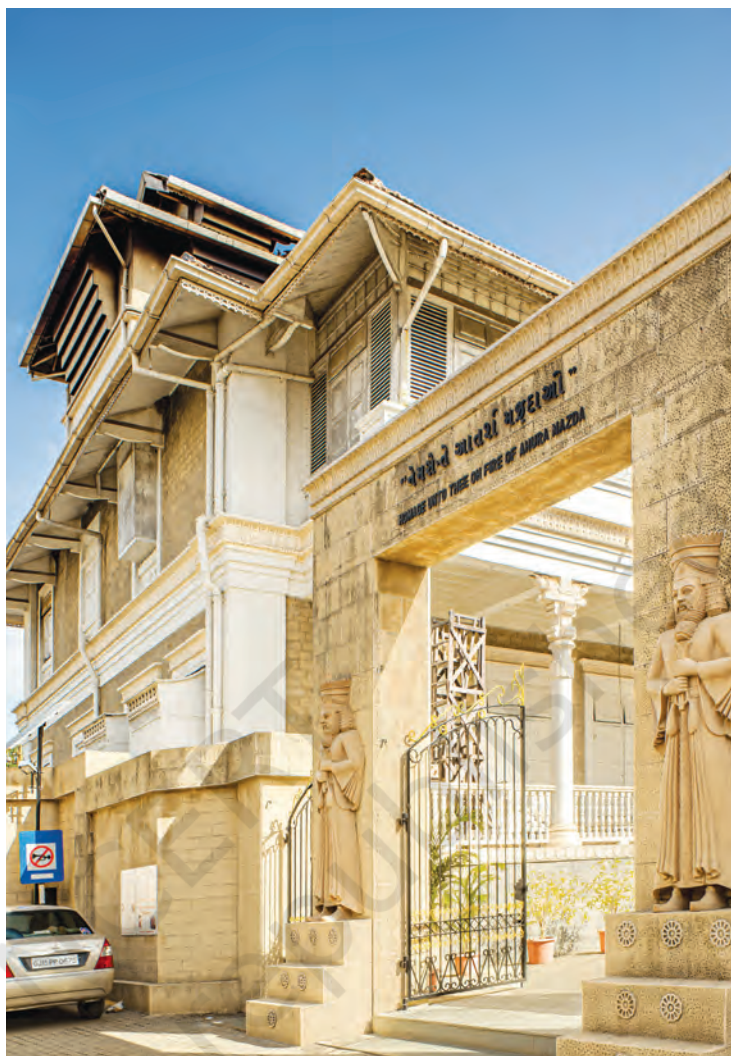
Fig. 5.6. An 18th-century Parsi fire temple in Udvaḍa (south Gujarat), close to the place where the Parsis first reached India.

The Parsis carried little with them — their sacred fire and some hope to make a home in a place they had heard was safe, India. Raja Jadi Rāṇā was the king of Sanjān, in coastal Gujarat. According to a legend, the Parsis approached the Raja for a safe place to stay. Since they were unfamiliar with each other's languages, the Raja showed them a jug full of milk, indicating that the kingdom was full and could not accommodate more people. A wise man among the Parsis took a spoon of sugar and dissolved it into the milk without allowing the milk to spill over. Jadi Rāṇā was pleased and provided a secure place for them to settle in his kingdom.