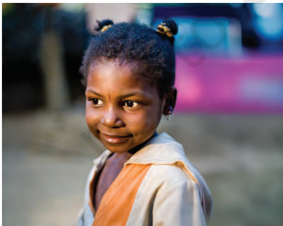
Fig. 5.9. Young Siddi girl from Karnataka

We have a different kind of story with the Siddis. The Siddis are of African origin; enslaved there, they were brought to India as slaves of Arab, Portuguese, and British traders between the 7th and 19th centuries. In the 18th century, some Siddis gained prominence in Muslim rulers' armies and briefly controlled