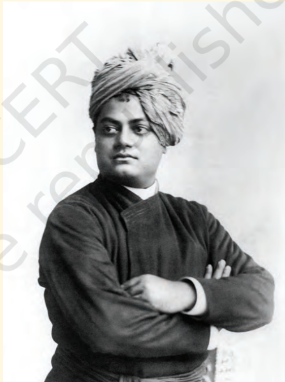
Fig. 5.1. Swami Vivekananda

I am proud to belong to a nation which has sheltered the persecuted and the refugees of all religions and all nations of the Earth. I am proud to tell you that we have gathered in our bosom the purest remnant of the Israelites, who came to Southern India and took refuge with us in the very year in which their holy temple was shattered to pieces by Roman tyranny. I am proud to belong to the religion which has sheltered and is still fostering the remnant of the grand Zoroastrian nation.