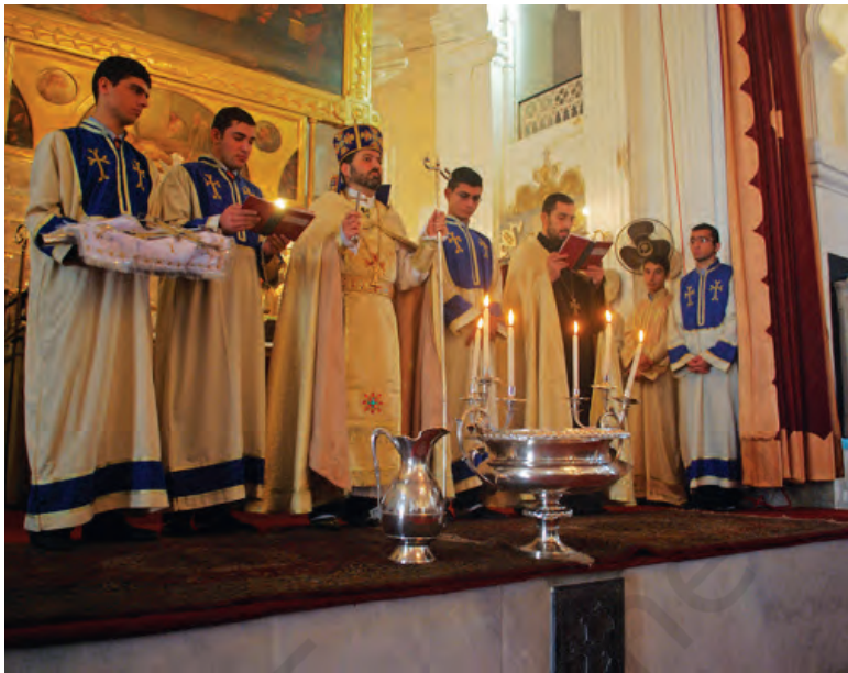
Fig. 5.13. Armenian Christmas at Armenian church, Kolkata.

Armenia is a relatively small, mountainous country located between Turkey and Azerbaijan, just north of Iran. Centuries ago, Armenian merchants traded in Indian spices and fine muslins. There is some historical evidence of them establishing a first settlement on the Malabar coast in the 8th century. During the time of the Mughals in the