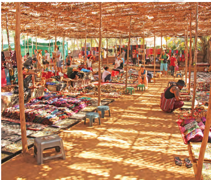
Fig. 5.16. A Tibetan market in Goa

Today, Tibetan medicine remains popular in Himalayan regions, including Nepal and Bhutan. In India, institutions like Men-Tsee-Khang in Dharamshala (Himachal Pradesh) practise this system to treat chronic diseases and manage epidemics. It has also been integrated in the Government of India's AYUSH programme, which supports traditional and indigenous systems of medicine, including Ayurveda, Yoga and Naturopathy, Unani, Siddha, Sowa Rigpa, and Homoeopathy.