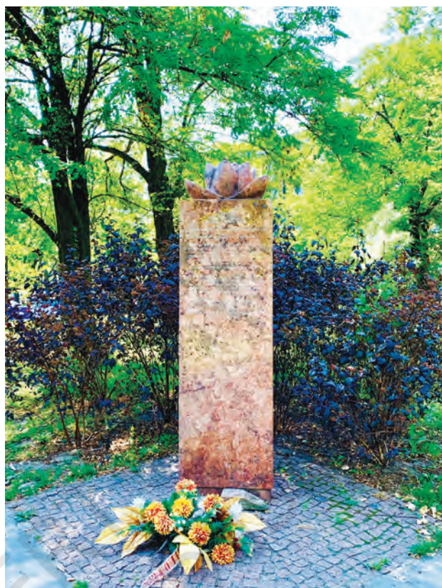
Fig. 5.15. Memorial in Warsaw: A tribute to Digvijaysinhji Ranjitsinhji in recognition of his help to Polish refugees during World War II.

In the early 21st century, his service to the people of Poland was recognised by the President of Poland and the monument was constructed in the Maharaja's honour. India was a home away from home, even if for a brief period, for the orphaned children.