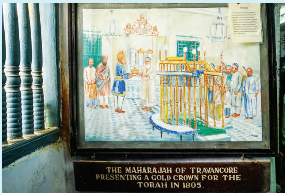
Fig. 5.2. A plaque in the Kochi synagogue.

Look at the two pictures below. Is the place shown in both the photographs the same? Why is the Maharaja of Travancore (the name of the kingdom in and around Kochi at that time) giving such an expensive gift to the Jewish synagogue for the Torah (religious book of the Jews)?