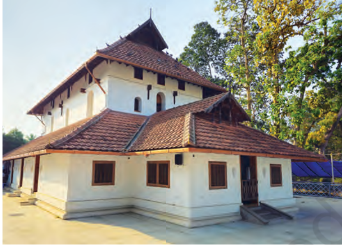
Fig. 5.8. Cheraman Juma Mosque, Kerala

These early Arab settlers in India came as peaceful traders, not as conquerors. They brought new ideas, culture, and religion, and played an important role in India's history of trade and cultural exchange.