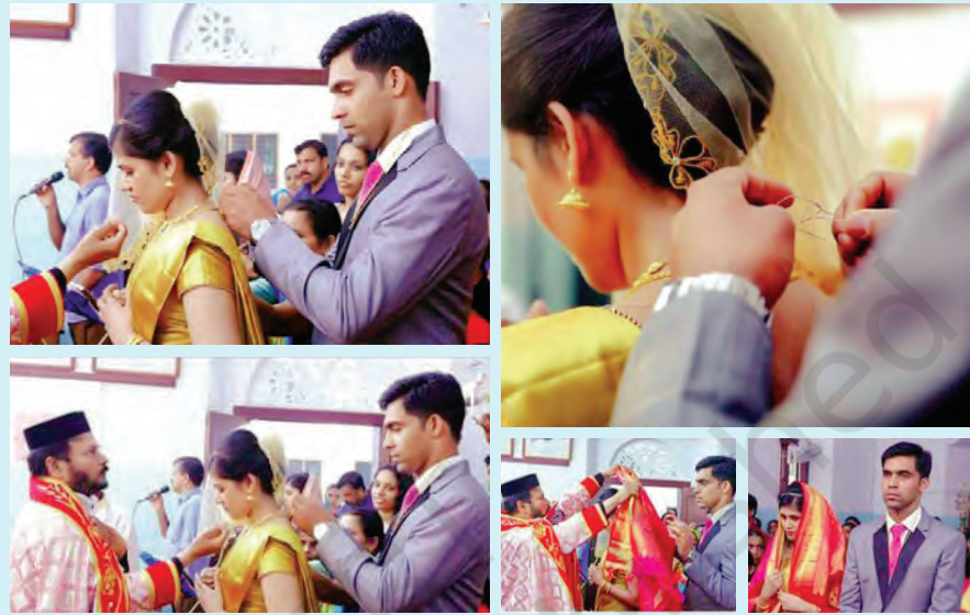
Fig. 5.5. A Syriac (Syrian) Christian wedding ceremony.

Observe the pictures below. What are the clues you get about the integration of the Syriac Christian community into Indian society?