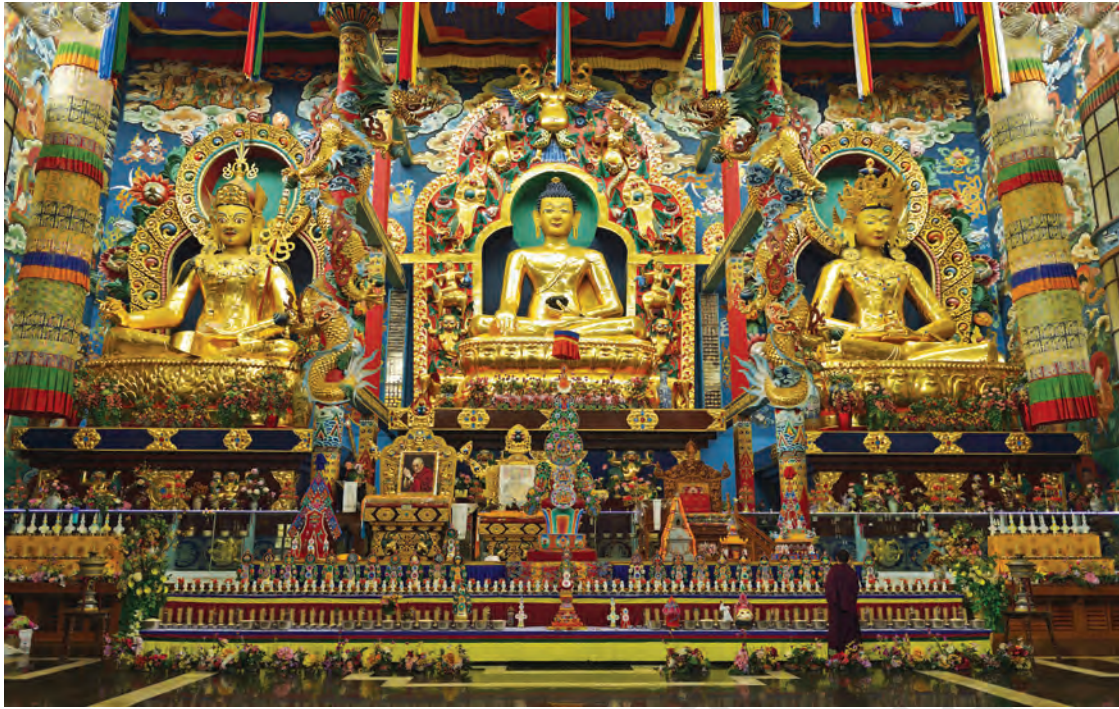
Fig. 5.17. Tibetan monastery at Bylakuppe, Karnataka

the government granted him asylum. Since then, he has been an 'honoured guest' in India and lives in Dharamshala (Himachal Pradesh), from where the Central Tibetan Administration functions as a government-in-exile. The Dalai Lama is known for his 'Four Commitments', namely the promotion of human values like compassion, forgiveness, tolerance; the promotion of religious harmony; the preservation of Tibetan culture; and the revival of India's civilisational heritage, particularly Indian values like karuṇā (compassion) and ahimsa (nonviolence).